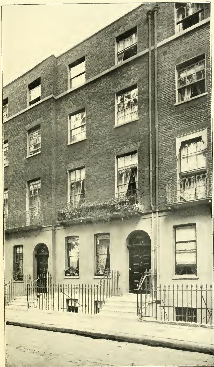
THE HOUSE IN WHICH CHRISTINA ROSSETTI DIED.